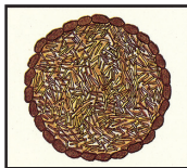
German Chocolate Cake