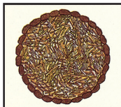
German Chocolate Cake