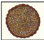
German Chocolate Cake